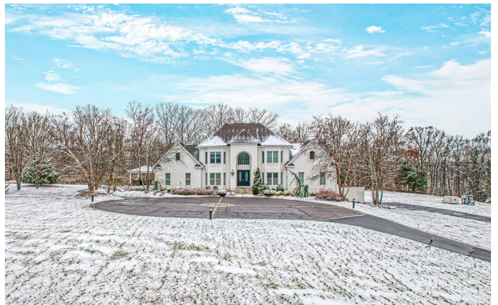
22101 Evergreen Mills Road Sold $2,800,000

Call today for a complimentary consultation.