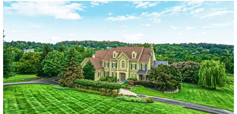
17251 Winning Colors Place Sold $2,249,000