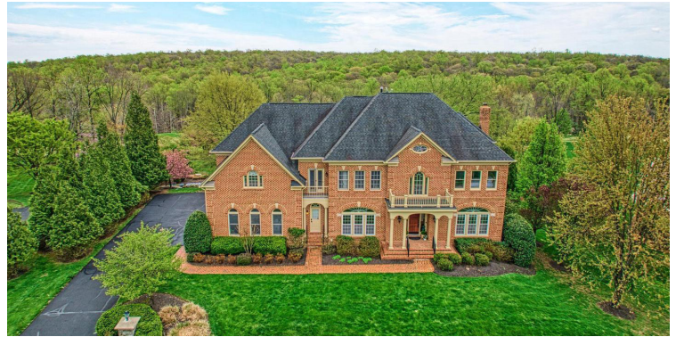
17070 Winning Colors Place Sold $1,760,000 Buyer Representation