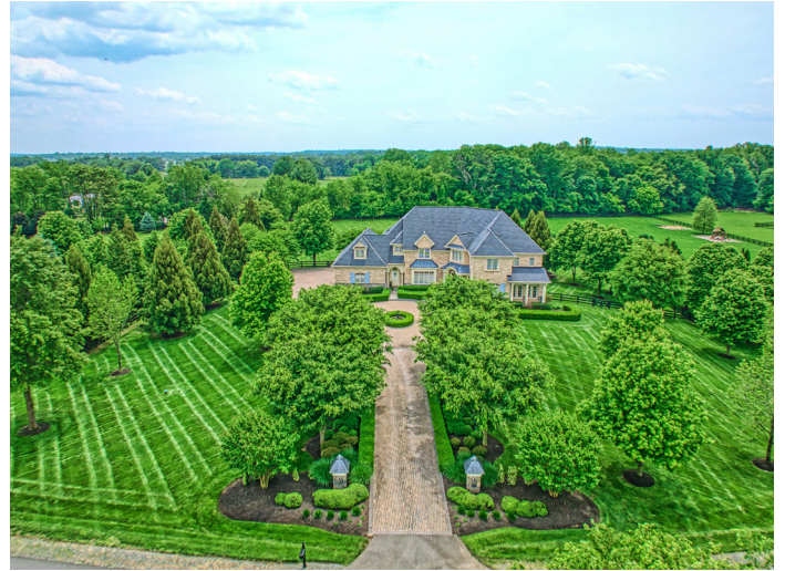
41085 Grenata Preserve Place Sold $3,000,000