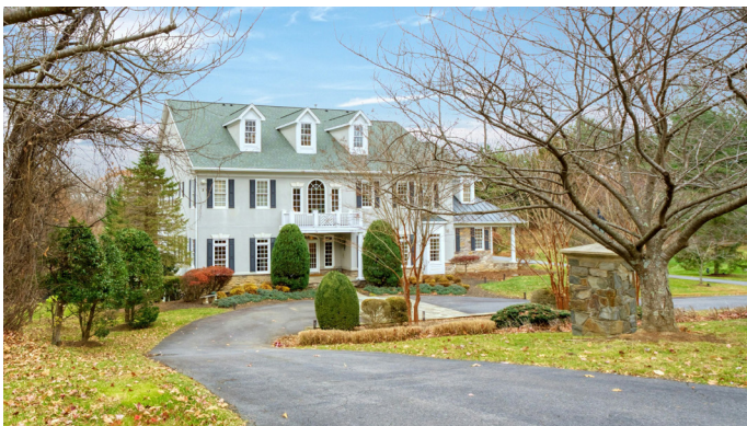
Sold in 2026 in Beacon Hill 40398 Beacon Hill Drive Leesburg, VA 20176 $1,850,000 Sold Price