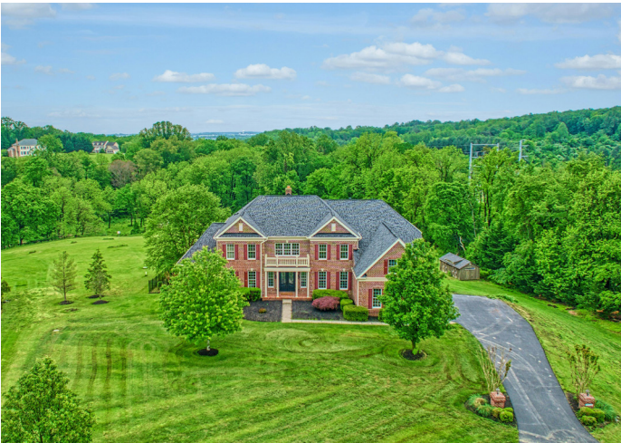
18102 Eaglesham Court Sold $1,825,000