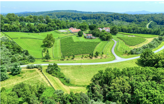
40954 Canter Lane Sold $3,188,519