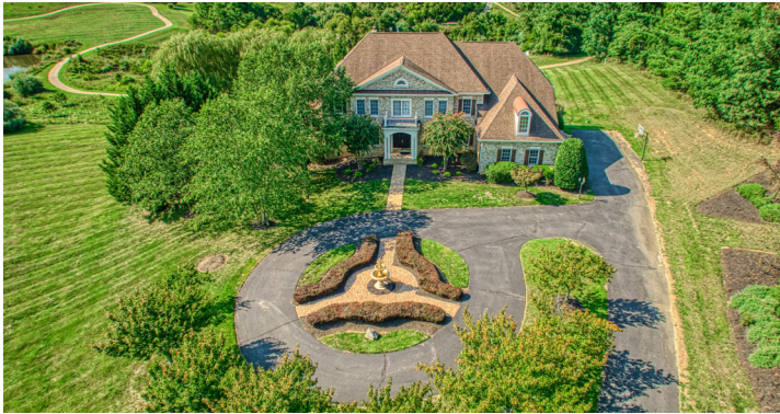
17279 Count Turf Place Sold $2,100,000