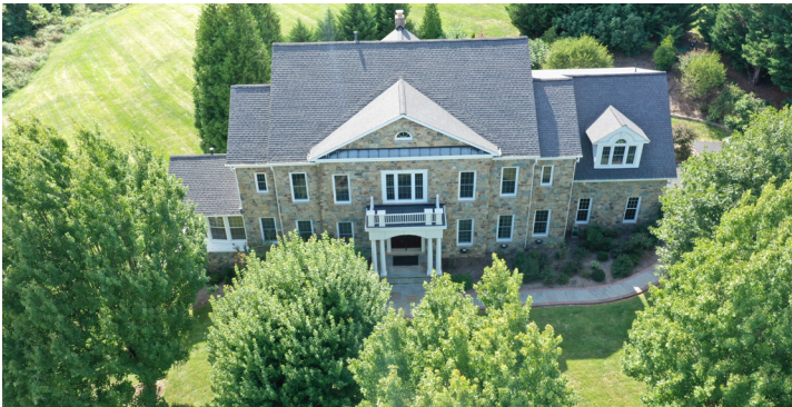
17181 Bold Venture Sold $1,550,000 Buyer Representation