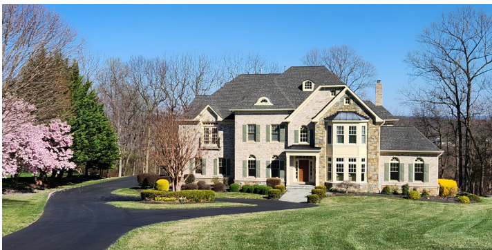
17042 Bold Venture Drive Sold $1,835,000