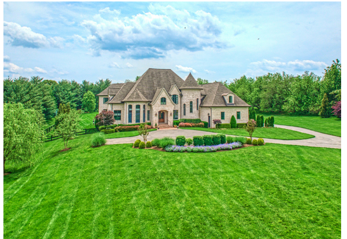
41235 Grenata Preserve Place Sold $2,700,000