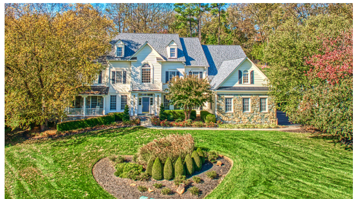
Under Contract in Beacon Hill 40521 Tim Tam Court Leesburg, VA 20176 $2,399,999

Sotheby's International Realty and the Sotheby's International Realty logo are registered (or unregistered) service marks used with permission. Sotheby's International Realty Affiliates LLC fully supports the principles of the Fair Housing Act and the Equal Opportunity Act. Each Office Is Independently Owned And Operated. If your property is listed with a real estate broker, please disregard. It is not our intention to solicit the offerings of other real estate brokers. We are happy to work with them and cooperate fully.