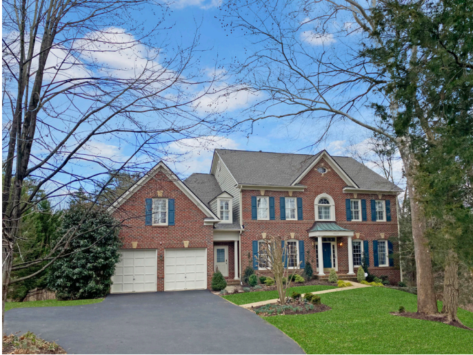
43625 Emerald Dunes Place Sold $1,560,000