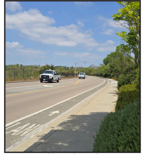
Southbound Douglas at Cardiff Bay Drive.