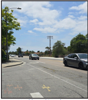
Northbound Douglas at Cardiff Bay Drive.

Safety starts at home—and carries onto every street we share. In our beautiful neighborhood, we're fortunate to have several ways in and out, but some are more challenging than others. The intersection at Cardiff Bay and Douglas is one many of us approach with extra caution. The curve limits visibility, traffic moves quickly, and conditions have only intensified over time.