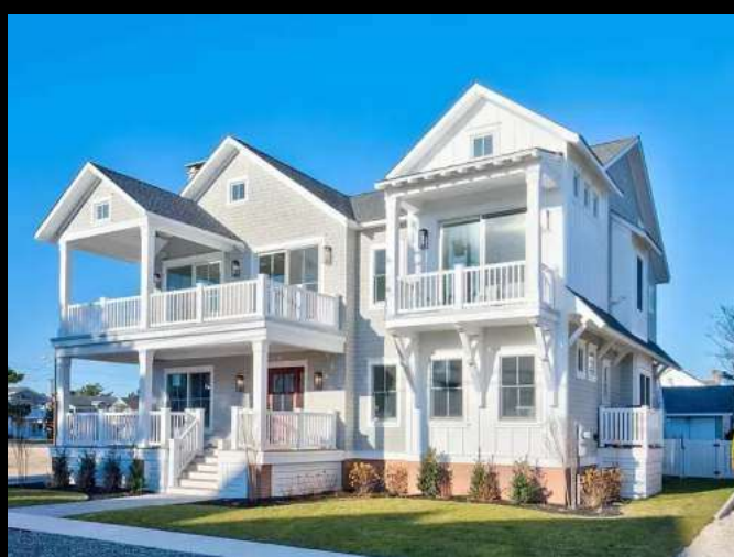
STONE HARBOR, NJ

https://jerseyhomebuyer.com/search-properties/