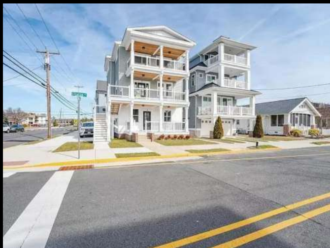
OCEAN CITY, NJ

https://jerseyhomebuyer.com/search-properties/