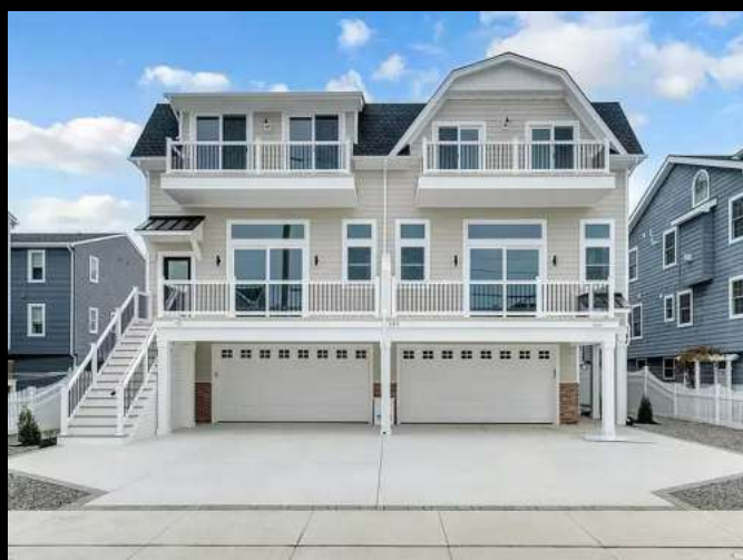
SEA ISLE CITY, NJ

https://jerseyhomebuyer.com/search-properties/